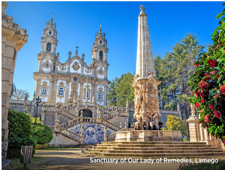
Sanctuary of Our Lady of Remedies, Lamego

secrets of its fortress and perhaps try some typical local products. Return to the ship for lunch and relax on deck as the ship sails through idyllic surroundings on the way to Régua. Meals: B, L, D