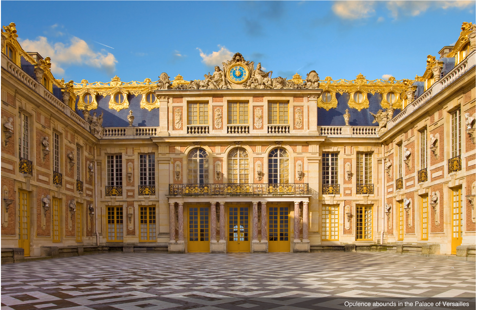
Opulence abounds in the Palace of Versailles